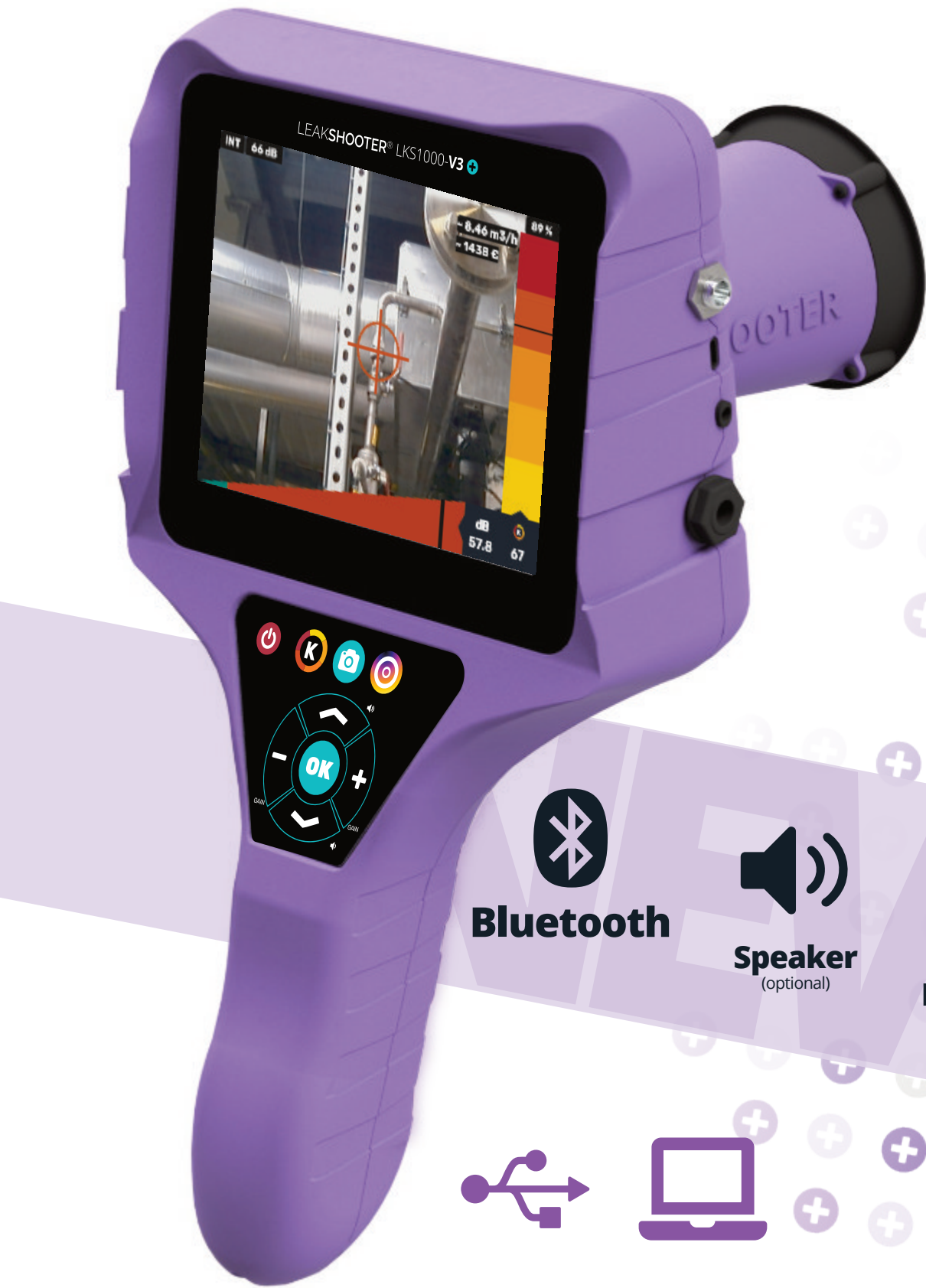
COMPRESSED AIR LEAK DETECTION